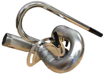
PACKAGE 1 U50 Chassis without Nozzle