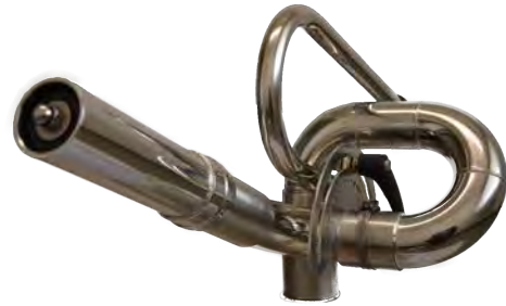
PACKAGE 2 U50 with JETRANGE

Part Numbers: UKN50020 JR50 Package Price: