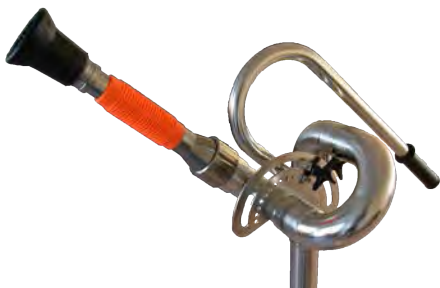
PACKAGE 3 U50 with V20

Part Numbers: UKN50020 JR50 Package Price: