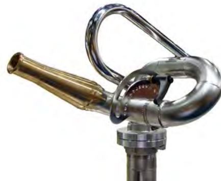
PACKAGE 4 U50 with 24mm Smooth Bore